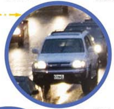
True Day/Night or Color in Low Light